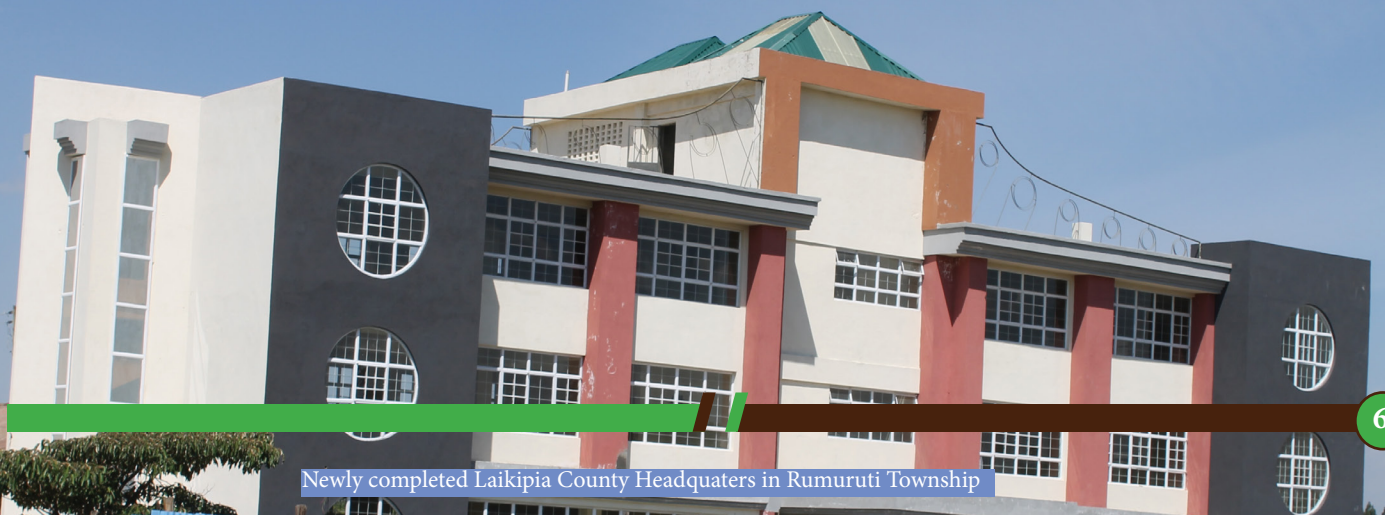
Newly completed Laikipia County Headquarters in Rumuruti Township