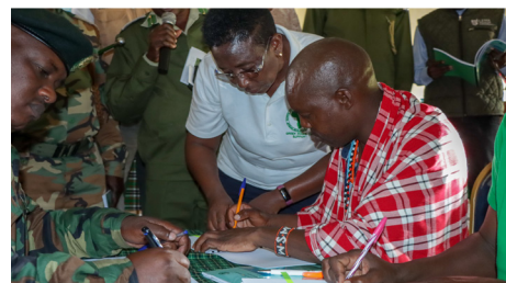
By John Muriithi

The signed plan will provide a roadmap for enterprises like beekeeping, ecotourism, herbal medicine development and research, and education geared towards the enhanced livelihood of the community adjacent to the forest. Implementation of the plan will include, among other activities, the planting of trees in the forest.