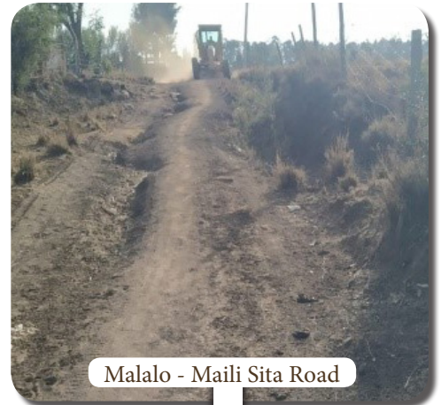
Malalo - Maili Sita Road