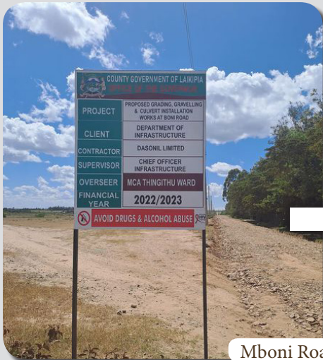
Mboni Road - Thingithu