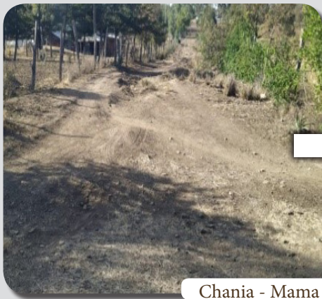
Chania - Mama Kinya Rd - Umande