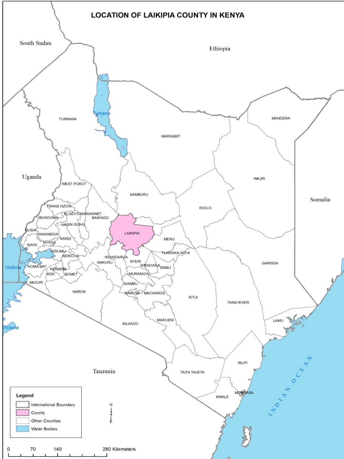
Fig. 1: Map of Kenya, Location of Laikipia County