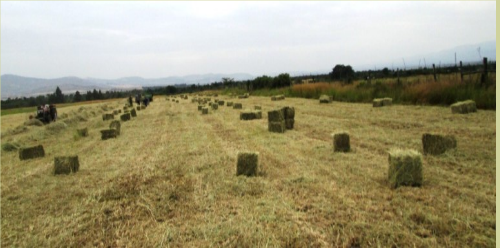
Lukuai Hay Farm near Nanyuki, Laikipia County