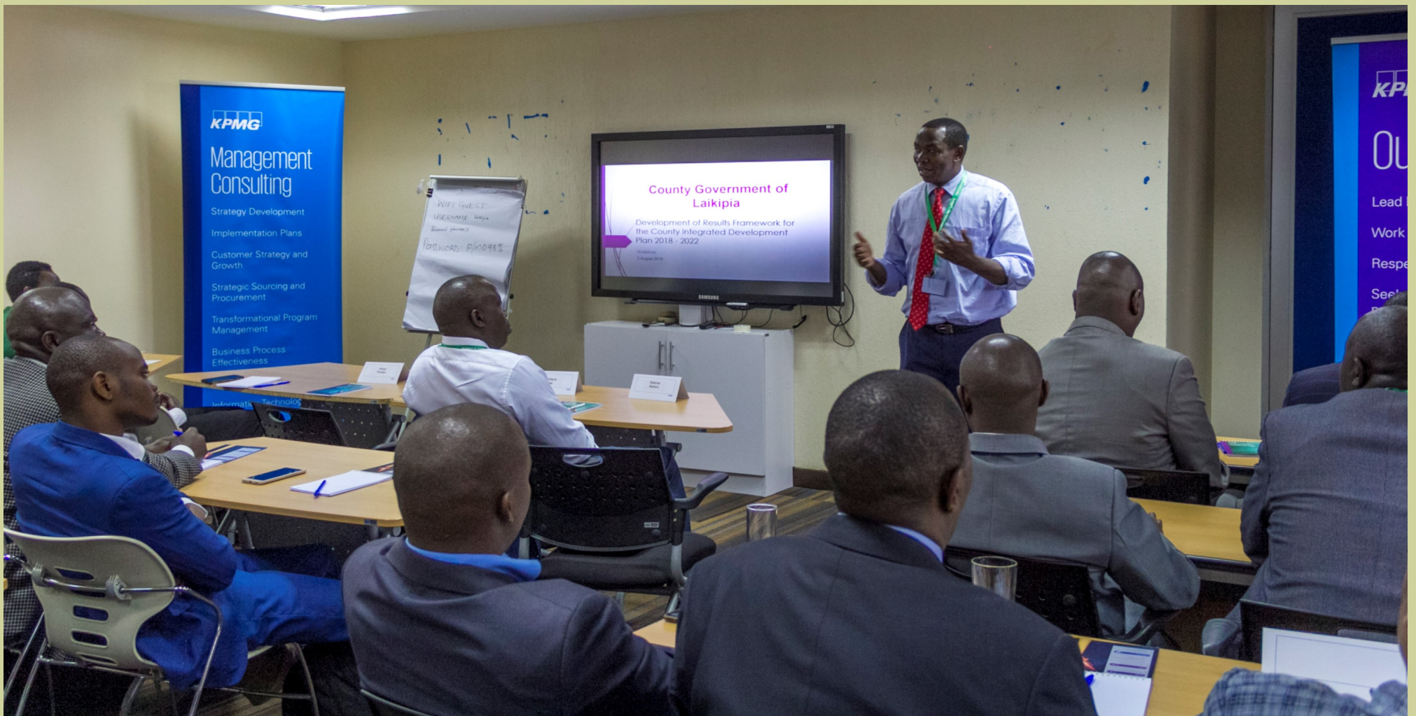
Senior Laikipia County Government managers attending a results management framework training at KPMG offices in Nairobi in 2018

Performance culture inculcated in the Laikipia county public service three years ago has been noted by other organizations which are seeking to poach staff