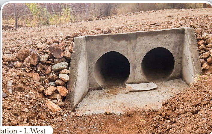
Culverts installation - L.West