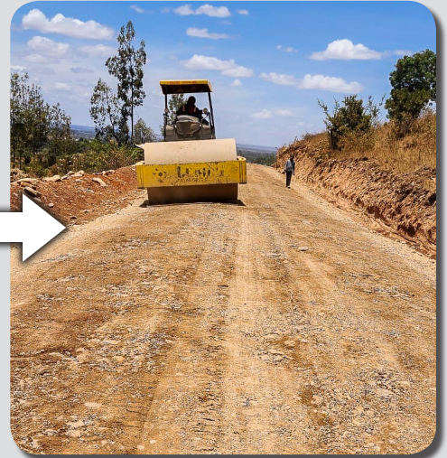
Ndurumo-Kabage Rd - Rumuruti