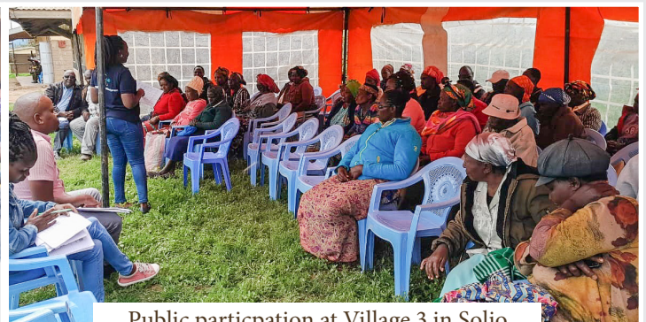
Public participation at Village 3 in Solio