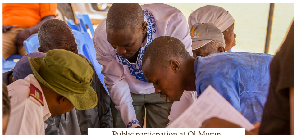
Public participation at Ol Moran

Further, government is committed to honouring debt, but, the audited