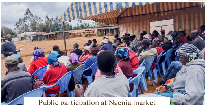
Public participation at Ngenia market