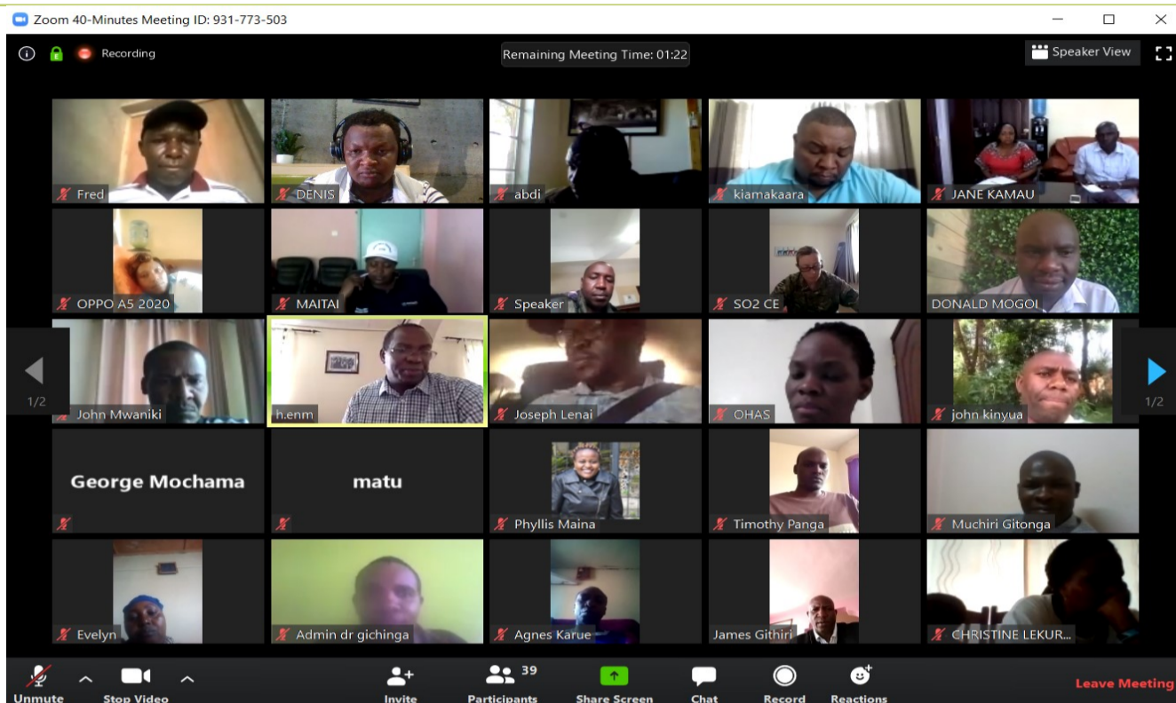
A screen display of an ongoing online video conference in Laikipia

Following the break through in the use of video