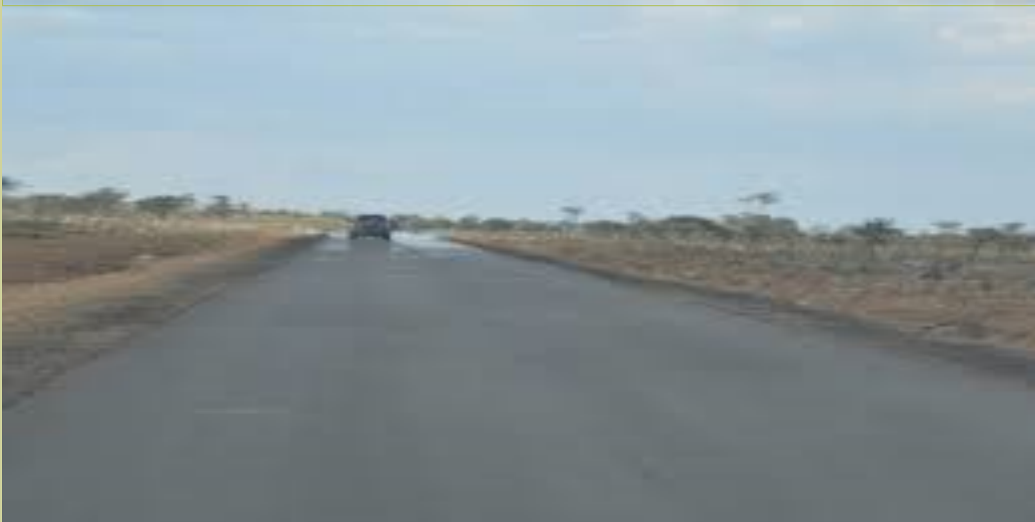
A section of the Rumuruti-Sipili-Kinamba road