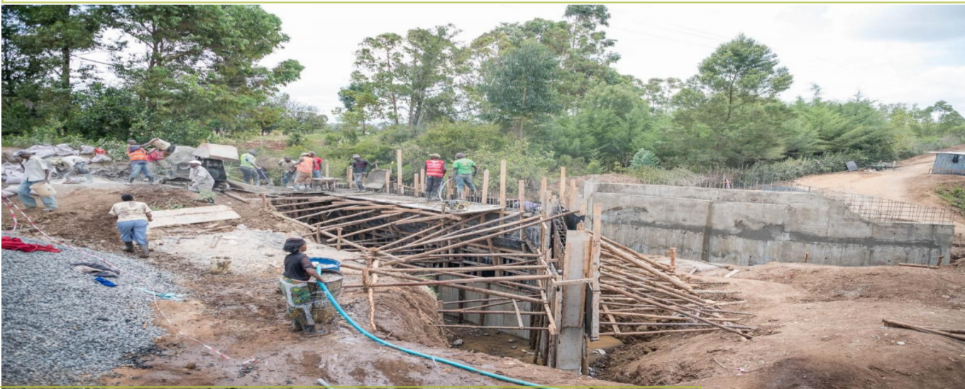
Gachwero Bridge in Umande ward

A report on the progress of the roads upgrade program using the leased equipment program has revealed the financial benefits the approach has achieved. The report shows that the leasing approach is three to five times cheaper than ordinary contracting, with additional benefits on timely delivery of the projects. Through ordinary contracting, a kilometer of road costs the tax payer approximately 1.5 million shillings, while the leasing program costs 300 thousand shillings for every kilometer. The resulting financial savings is a ripple effect on the entire county road construction program, as the leasing program frees up more cash to accom-