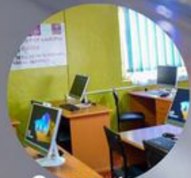
Computer Packages / Programming