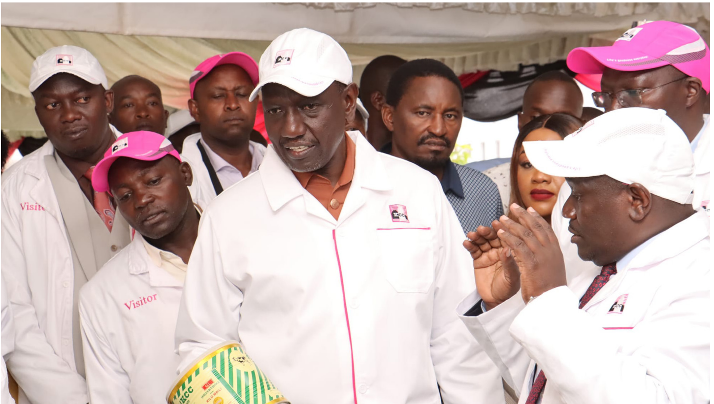
President Ruto in Laikipia West where he commissioned a modernized KCC Factory