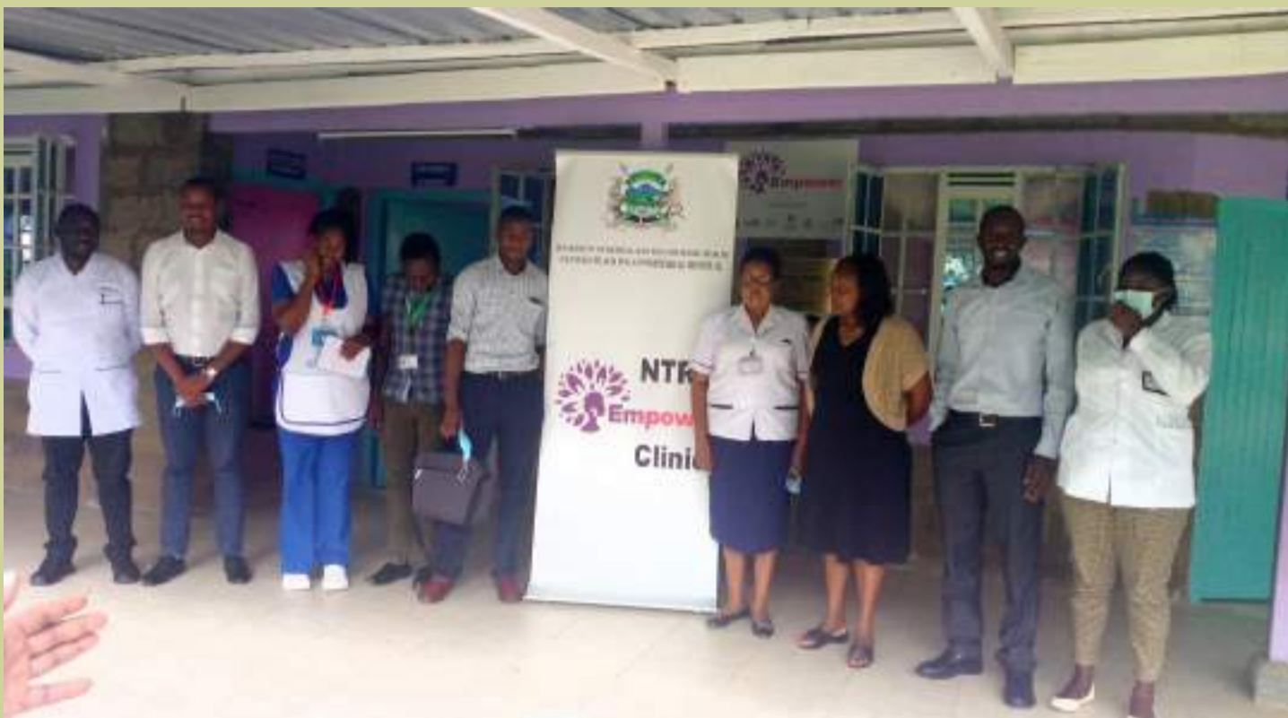
LHS Nanyuki Empower Clinic with a team from the International Cancer Institute during the launch of the Join cancer care platform late last month