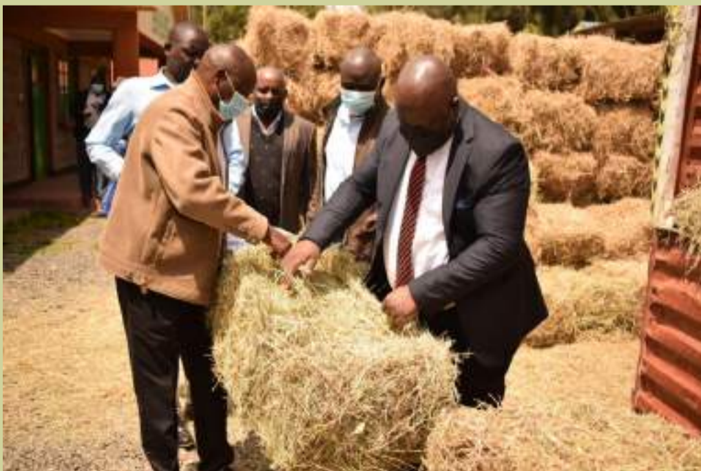
Distribution of hay to farmers by the county government to cushion the against the effects of prolonged drought

The acaricides will target of approximately 40000 heads of cattle in the county. The acaricide will help reduce the diseases mostly caused by pests, to the ticks. The distribution of acaricides is still ongoing in Ngobit ward where over 200 farmers from 9 locations have been