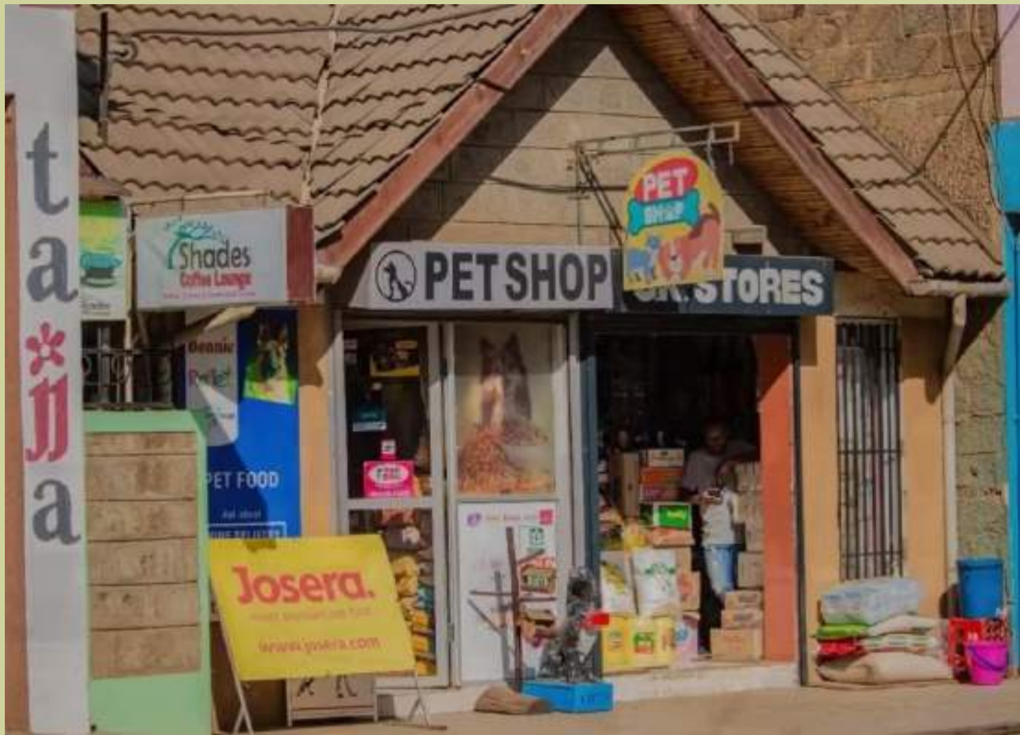
Some of the product in the only pet shop in Nanyuki town