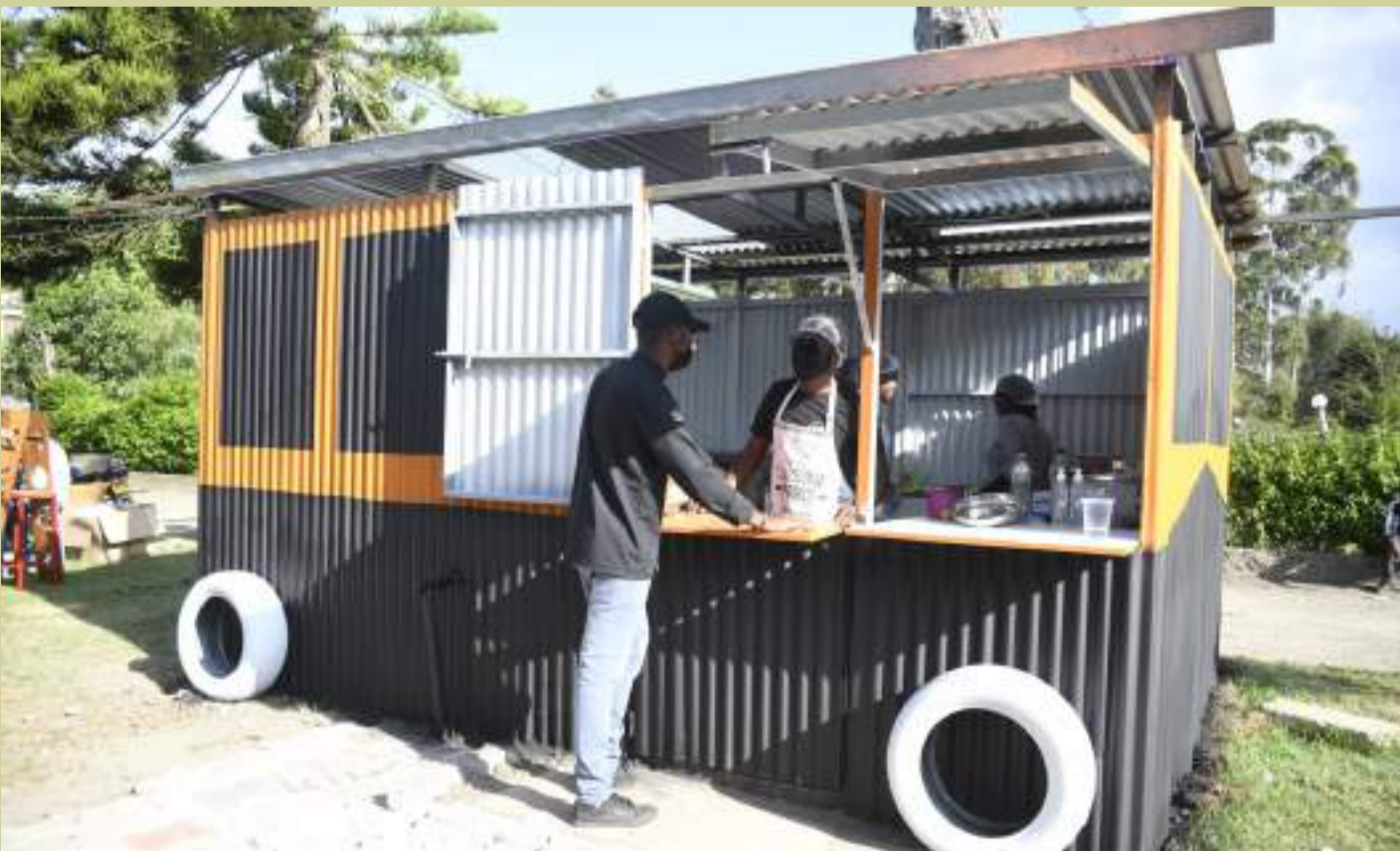
BaraBurrito business. Structure and design done by McBull Arts

New institutions have also opened up in Nnanyuki like Sollution Sacco, New Forties, Toyota Kenya, Quick Mart Supermarket, among others.