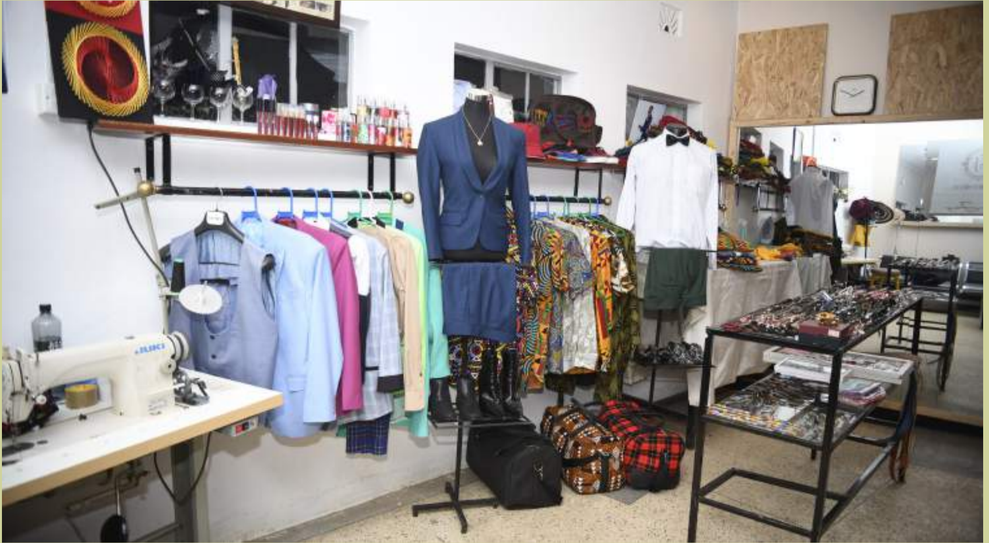
A display of variety of products from Sir Jay Suits

mindful people to give back to the society. Started around June 2021, the business is growing and expected to stabilize soon and offer employment to the locals.