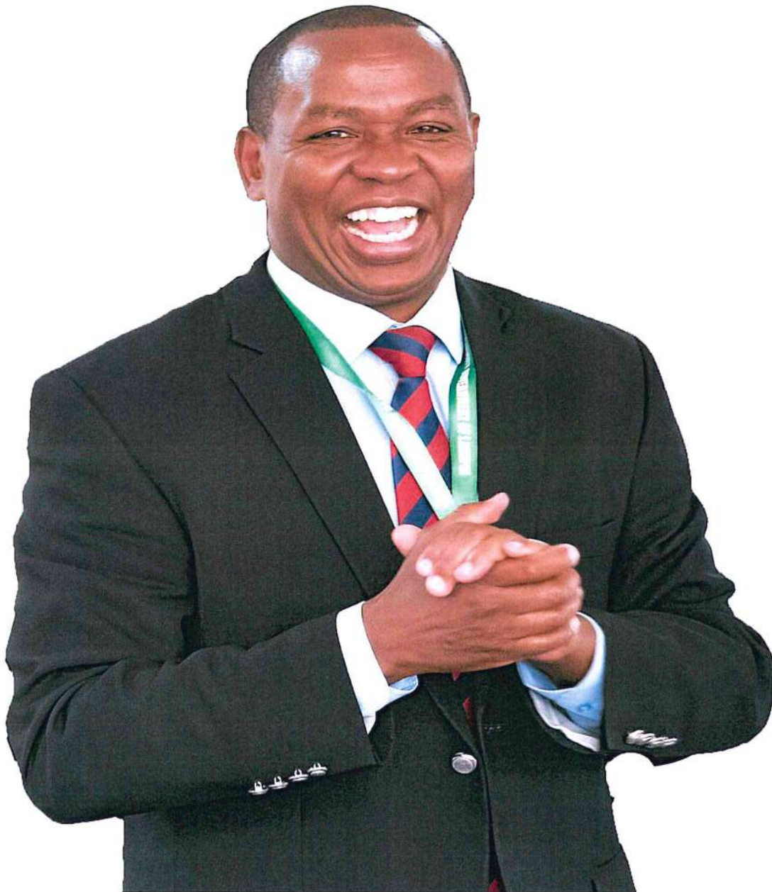
H.E NDIRITU MURIITHI GOVERNOR – COUNTY GOVERNMENT OF LAIKIPIA