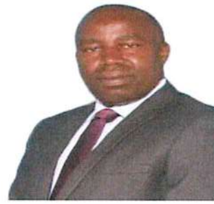
NJENGA KAHIRO CECM WATER AND NATURAL RESOURCES, Ag. CECM AGRICULTURE, LIVESTOCK & FISHERIES