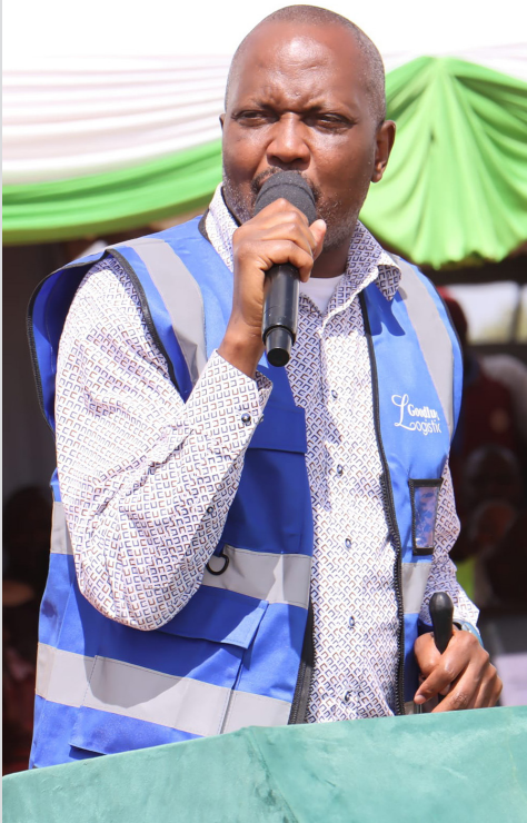
Image series of CAIP's Project Launch