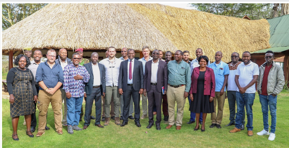
Leaders from COPAD bloc meet EU & NRT leads at Lewa Conservancy

The COPAD program is a peace-regional bloc webbed by a joint economic intervention agreement between the counties of Laikipia, Isiolo, Samburu and Baringo whose previously brand name was Amaya Triangle Initiative