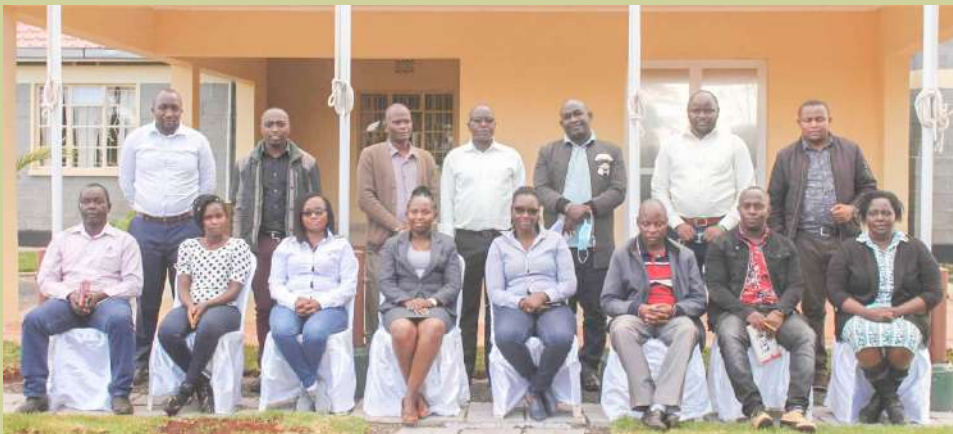
A delegation from Embu county join members of Laikipia County Revenue Board for a photo session after a successful benchmark exercise in November last year.

The use of technology through the implementation of the cashless mode of payment, installation of CCTV's in key revenue streams for revenue monitoring, vibrant and dynamic workforce are some of the factors that have ensured efficiency in revenue collection. These have minimized revenue leakages and thus enhanced performance and made Laikipia unique for others to learn from.