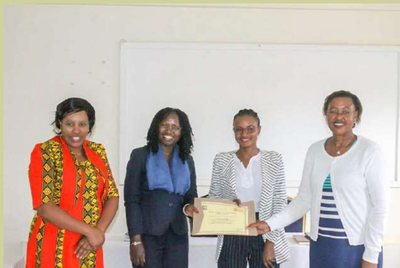
A Staff member of Laikipia County Revenue Board receives a certificate after completion of the Revenue Enhancement course at the Kenya School of Government Embu Campus

Further, the Laikipia County Revenue Board carried out Team building exercises