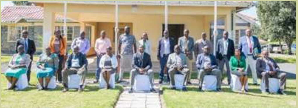
Governor Ndiritu Muriithi pose with Uasin Gishu County staff members during a benchmarking exercise in Nanyuki on revenue collection

A recognition by the County Revenue Allocation (CRA) in terms of collection of own source revenue, is a remarkable achievement which has raised