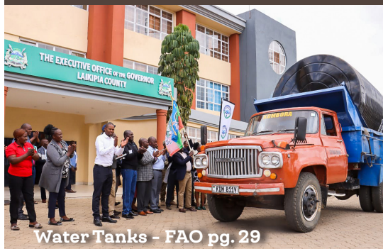
Water Tanks - FAO pg. 29