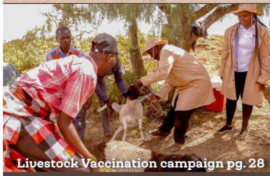
Livestock Vaccination campaign pg. 28