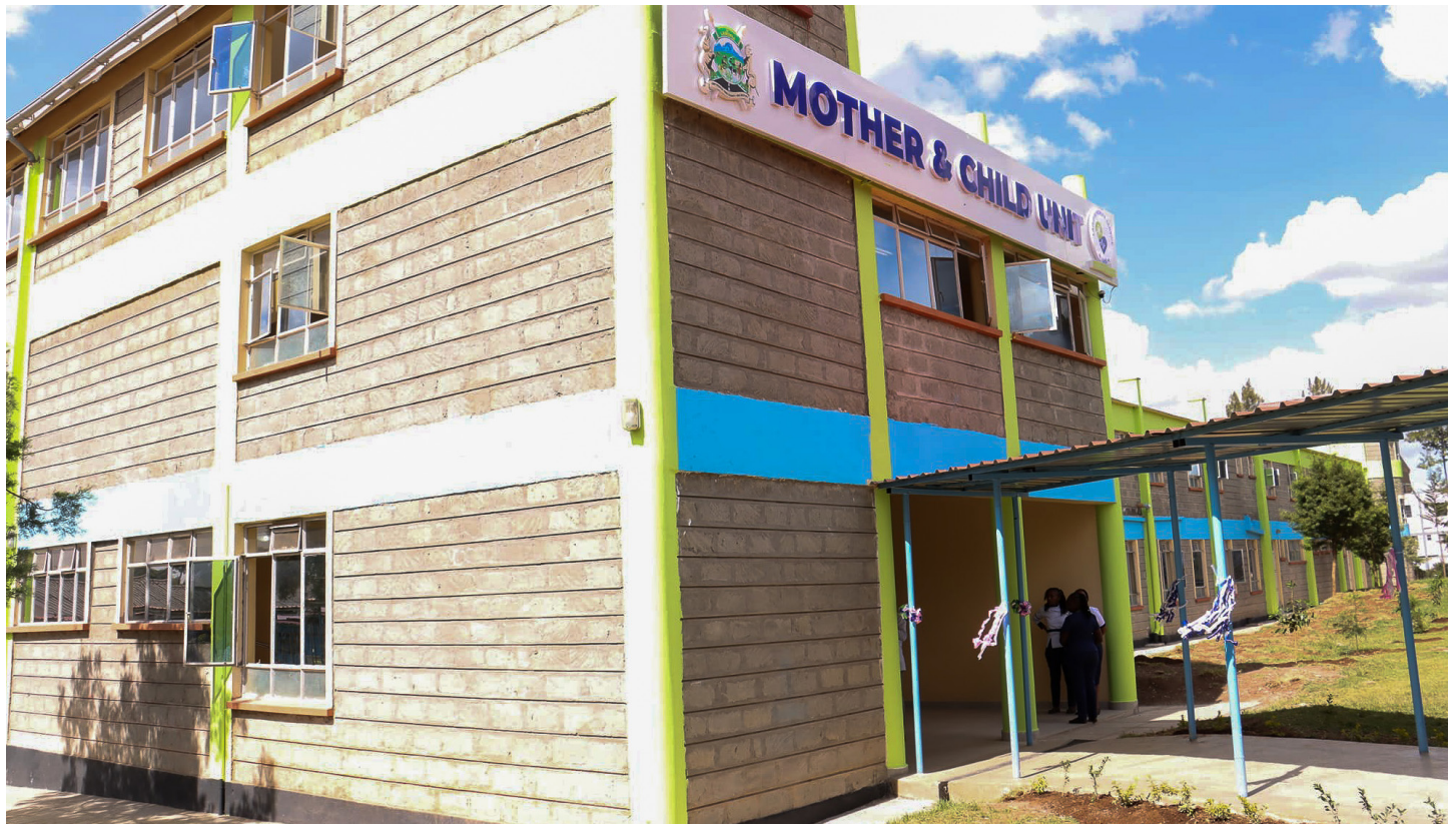
With 80-bed maternity ward, a 20-cot newborn unit, 2 theatres & a 20-bed gynaecology ward